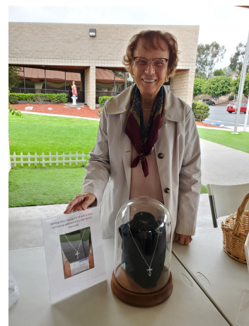
Helen Barnes Diamond & Silver Cross Necklace