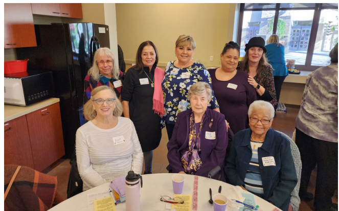
Photos from the ODCCW General Gathering on January 17.