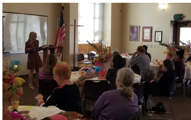
Photos from the ODCCW General Gathering on February 21.